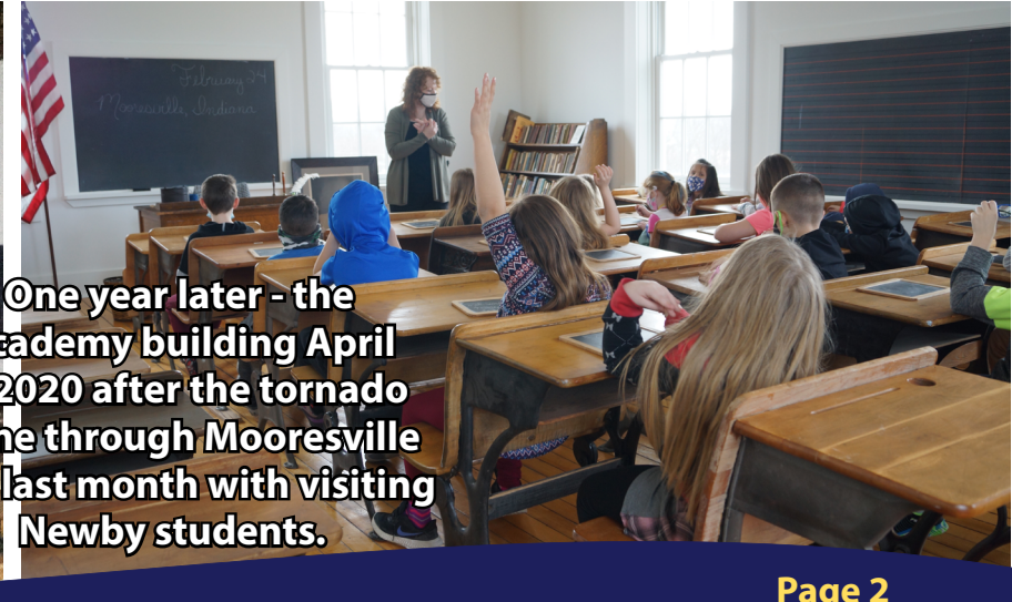
One year later - the Academy building April 8, 2020 after the tornado came through Mooresville and last month with visiting Newby students.